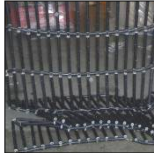
A close-up view of the flexi-grid

A diagram showing how bycatch can escape through the flexi-grid in a trawl net