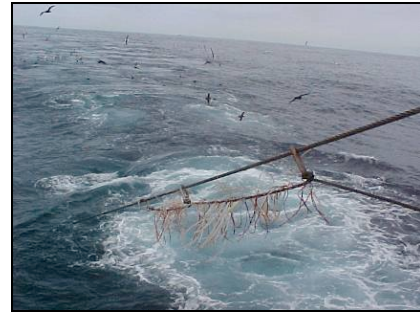
The contraption keeps seabirds away from the warp line of a trawler