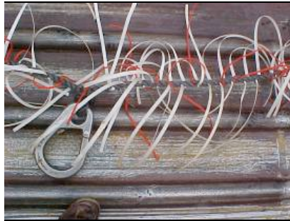
A close view of the rope, which looks like a bottlebrush