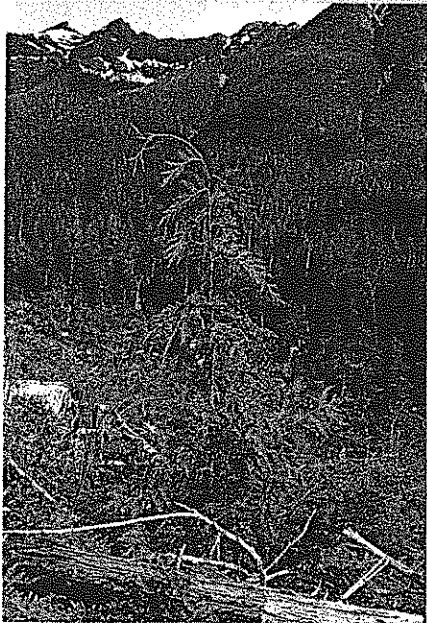
PAUL E. HENNON

If reduced snowpack leaves yellow-cedar seedlings and saplings exposed, browsing deer may compound the problem of the species' naturally low regeneration.